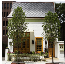
Table 52 52 W. Elm St. 312.573.4000